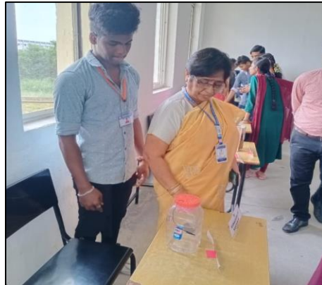
Project presentation by Bridge course students