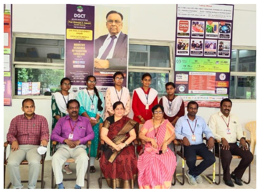
Tea Time Tutors rewarded with seed fund Rs. 10000 (Rs. 2000 each) for entrepreneurship activity.