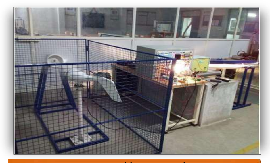
Renewable Energy Lab