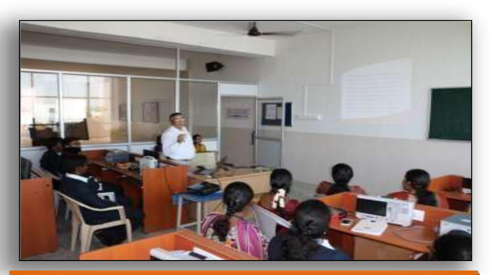
Tessolve Semiconductor Test Engineering Lab