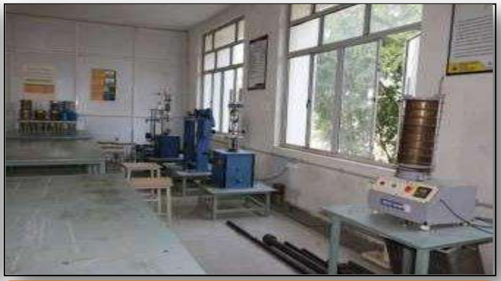
Soil Mechanics Lab