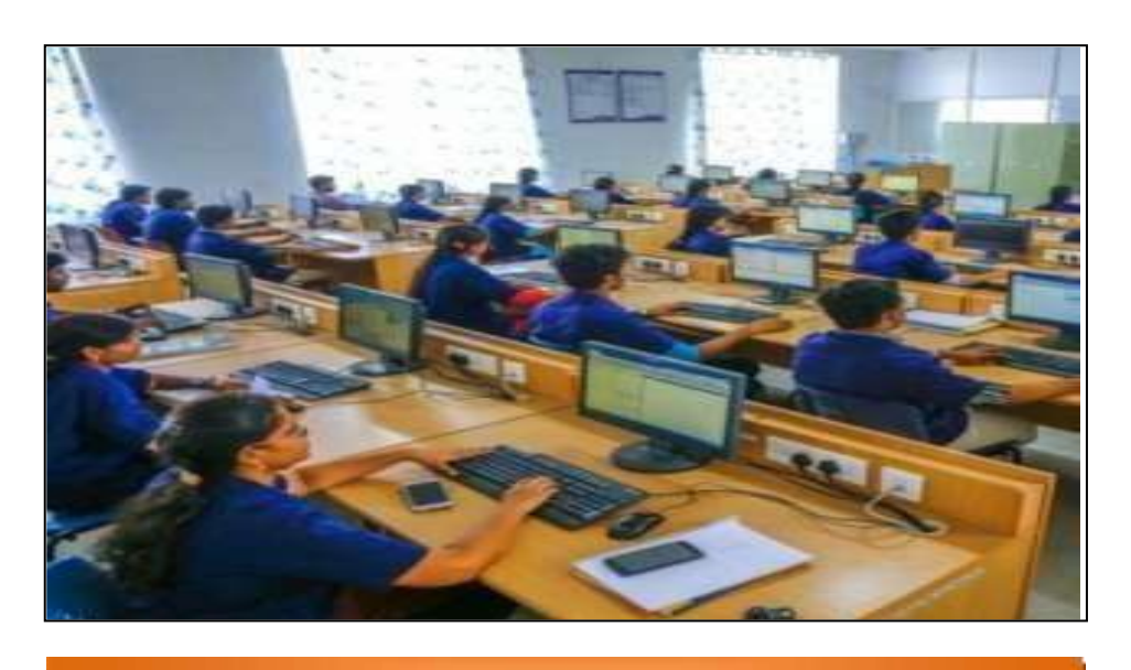
Power System Simulation Lab