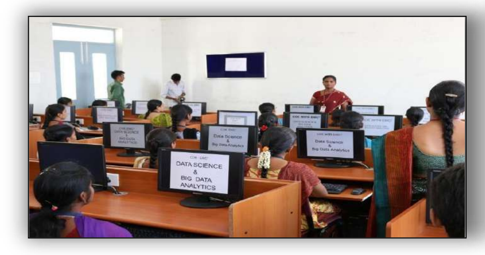
Big Data Analytics with EMC<sup>2</sup>