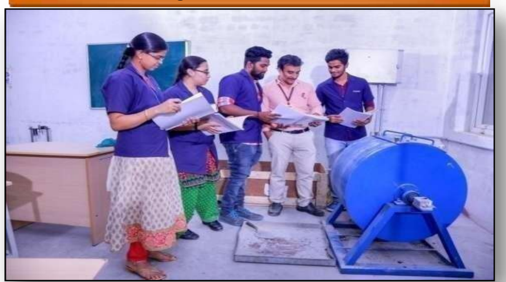
Concrete & Highway Engineering Lab