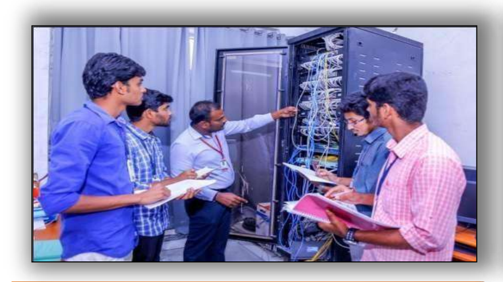
CISCO Networking and Security Lab