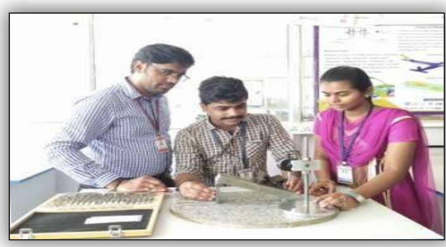
Metrology and Measurements Lab