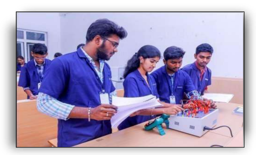
Electronic Circuits Lab