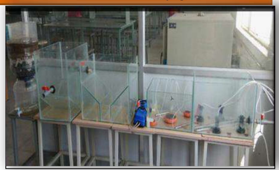
Centre for Sustainable Development