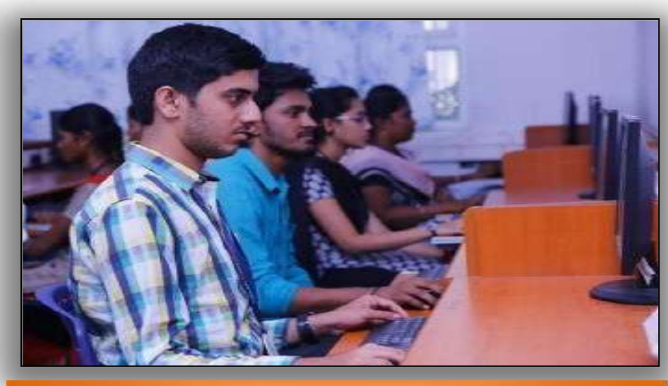
NI LabVIEW Academy