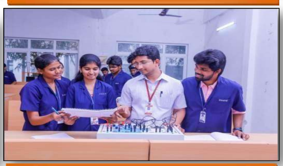
Power Electronics and Drives Lab