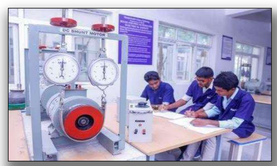
Electrical Machines - I Lab