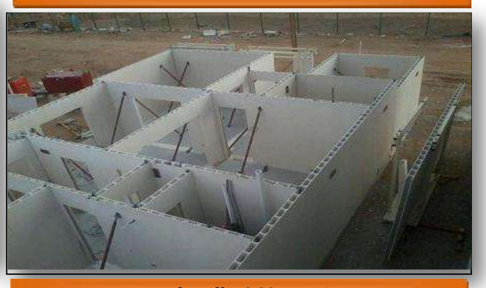
Centre for Affordable Housing