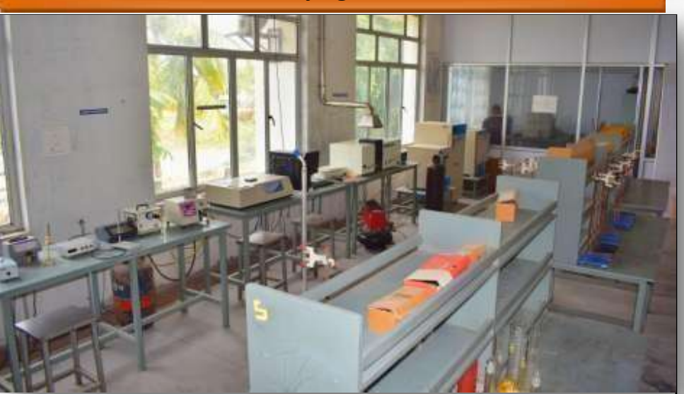
Environmental Engineering Lab