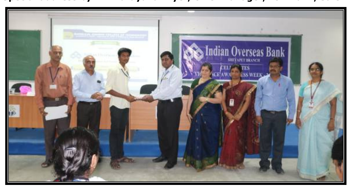
Prize distribution for essay competition