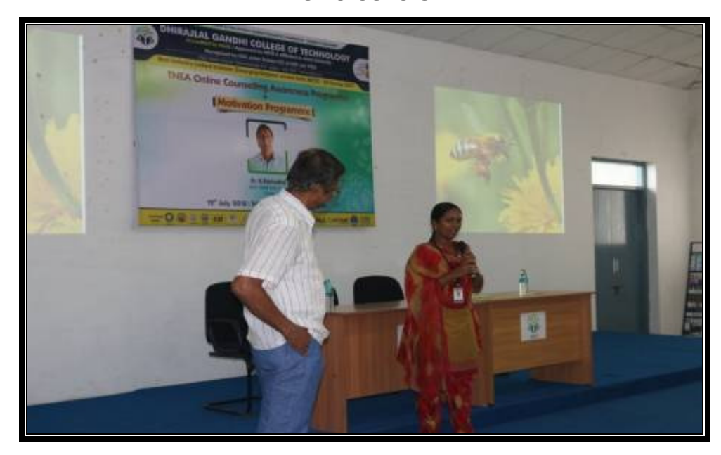
Student feed back in the Motivation program on MIND with VALUES